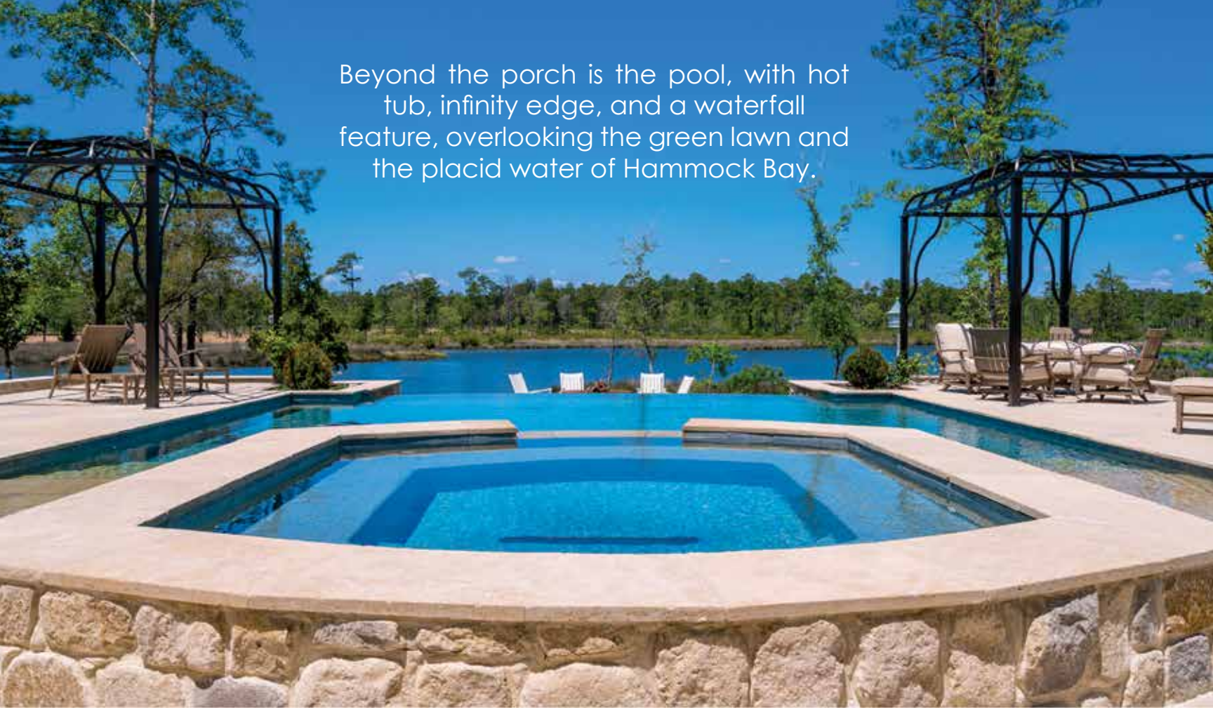
Beyond the porch is the pool, with hot tub, infinity edge, and a waterfall feature, overlooking the green lawn and the placid water of Hammock Bay.